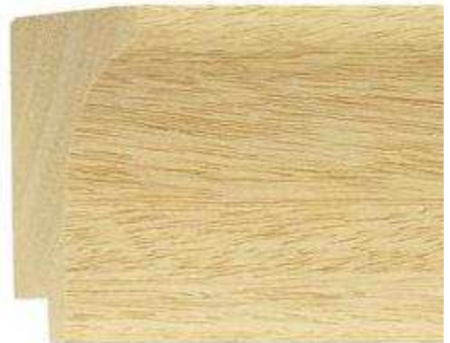
Natural Spoon - M4008NW Width: 63 mm Rebate Depth: 8 mm