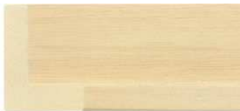
Natural; L Shape - M4005NW Width: 22 mm Rebate Depth: 12 mm