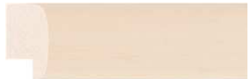
Natural, Cushion - M4037NW Width: 23 mm Rebate Depth: 8.5 mm