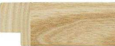
Natural Flat - M4022NW Width: 33 mm Rebate Depth: 17 mm