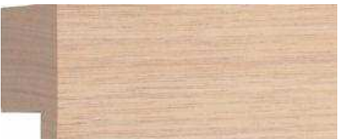
Natural Flat - M4025NW Width: 46 mm Rebate Depth: 13 mm