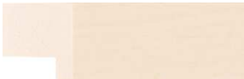
Natural Flat - M4036NW Width: 21.5 mm Rebate Depth: 16 mm