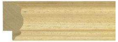
Natural Stepped Dome - M4013NW Width: 34 mm Rebate Depth: 8 mm