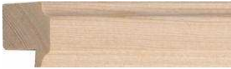
Natural Flat - M4029NW Width: 20 mm Rebate Depth: 9 mm