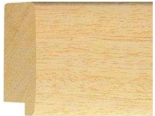
Natural Cushion - M4007NW Width: 71 mm Rebate Depth: 12 mm