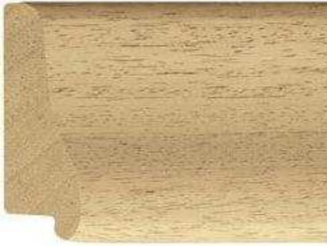
Natural Reverse - M4001NW Width: 63 mm Rebate Depth: 13 mm