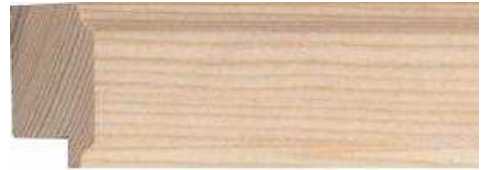
Natural Stepped Flat - M4030NW Width: 29 mm Rebate Depth: 10 mm