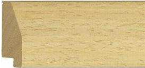
Natural Reverse - M4014NW Width: 45 mm Rebate Depth: 7 mm