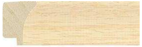
Natural Scoop - M4032NW Width: 30 mm Rebate Depth: 9 mm