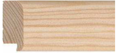
Natural Cushion - M4028NW Width: 38 mm Rebate Depth: 10 mm