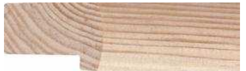
Natural Cushion - M4023NW Width: 29 mm Rebate Depth: 32 mm