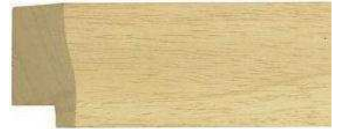
Natural Reverse - M4015NW Width: 38 mm Rebate Depth: 13 mm