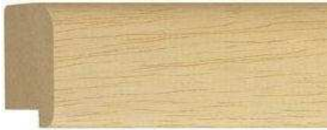
Natural Cushion - M4012NW Width: 38 mm Rebate Depth: 10 mm