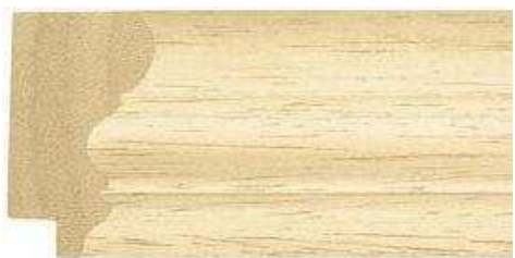
Natural Scoop - M4010NW Width: 47 mm Rebate Depth: 9 mm