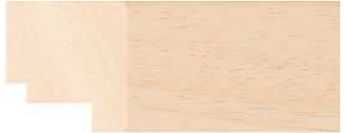
Natural Flat, Stepped - M4035NW Width: 30mm Rebate Depth: 20 mm