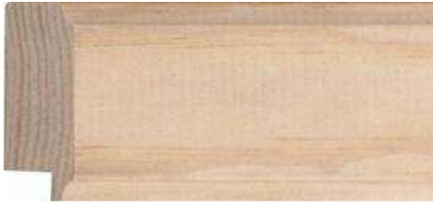
Natural Stepped Flat - M4027NW Width: 40 mm Rebate Depth: 10 mm