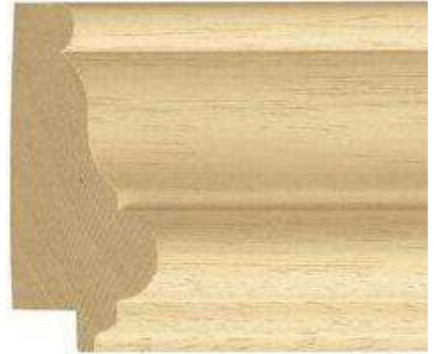
Natural Reverse - M4002NW Width: 69 mm Rebate Depth: 13 mm