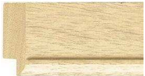
Natural Flat - M4011NW Width: 69 mm Rebate Depth: 13 mm