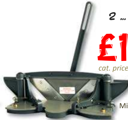
Mitre trimmer & Measure System