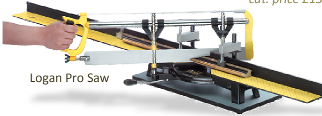
Logan Pro Saw

1 CUT THE MOULDING ... £115 cat. price £139